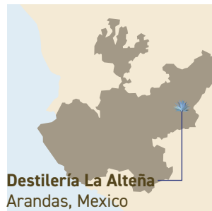
Destileria La Alteña Arandas, Mexico